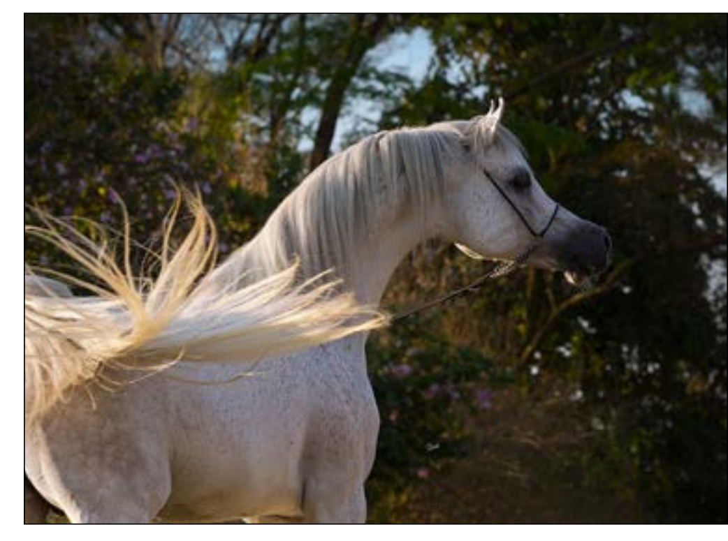
El Jahez WH (Juliusz De Wiec x Chili Pepper V), pictured at Haras FT in Brasil in 2019