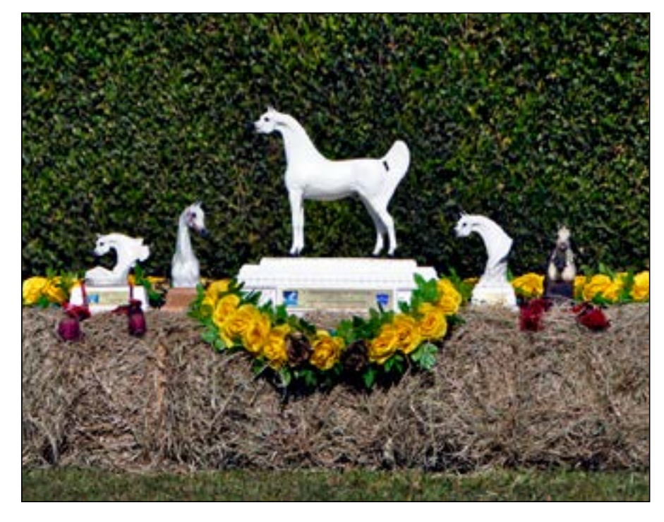
Only part of the prices won by El Jahez WH