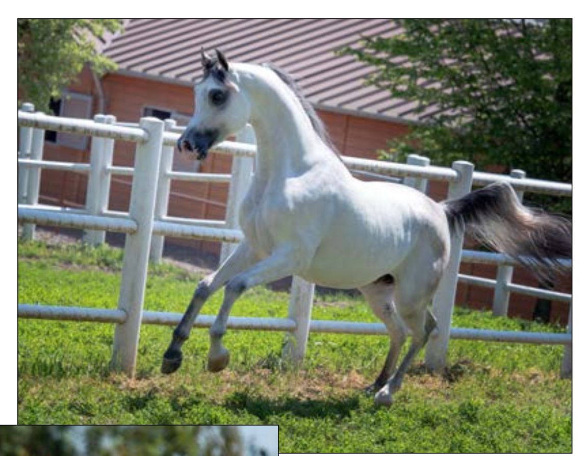
Eifell Meia Lua (El Jahez WH x Ezeyda Meia Lua), owned by La Movida Arabians