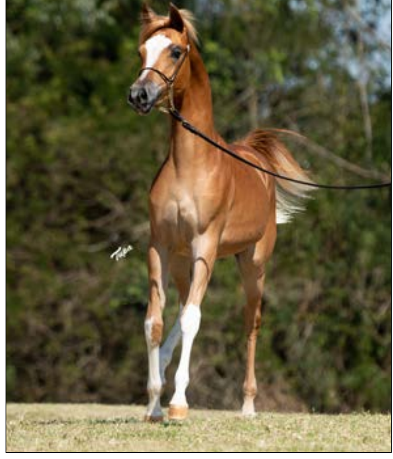
Filly sired by El Jahez WH, out of FT Sophie